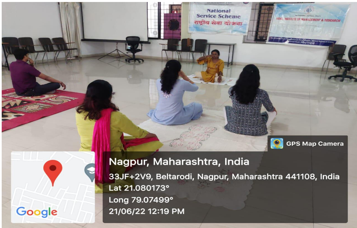
Faculty members and students performing Yoga